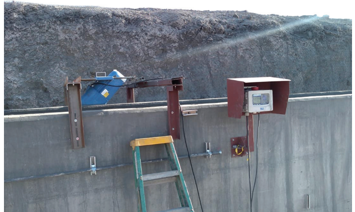
LaserFlow sensor and Signature flowmeter installation at an ore mine.

of accurate results that could be automatically turned into detailed reports for monitoring and regulatory use.